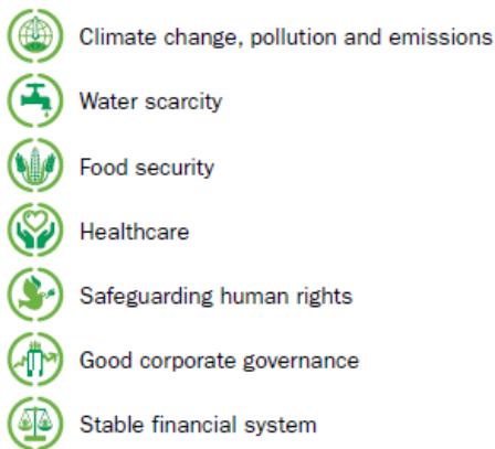
Figure 2: The seven social areas of focus

Climate change is a focus area of PGGM which finds a direct implementation in the systematic equity strategies through a reduction of the footprint of the investments. Through active ownership, such as engagement and voting, PGGM aims to contribute to good corporate governance and safeguarding human rights.